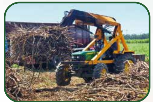
Sugar Cane Application