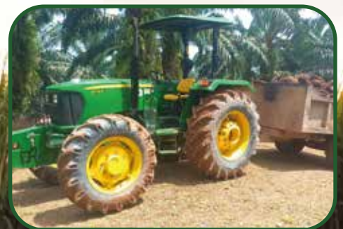
Palm Oil Application

Accessories shown are not the part of standard equipment.